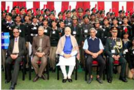
NCC Cadets in PM Rally