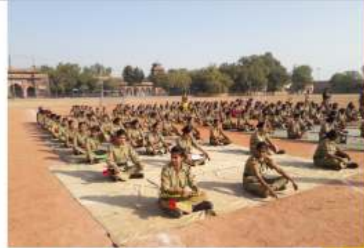
C/B Certificate Examination