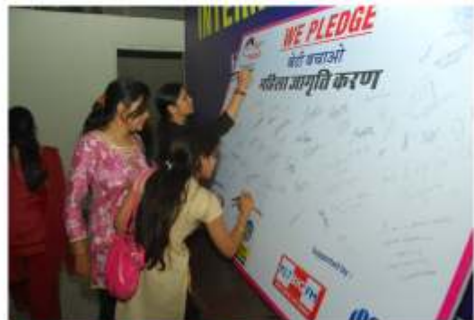
Beti Bachao Signature Drive