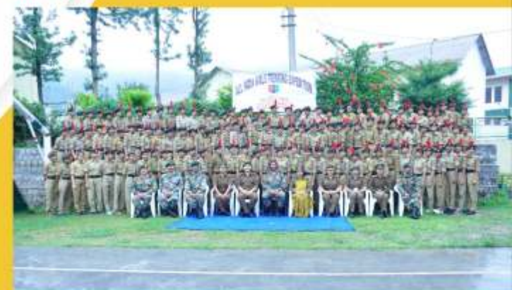
Rajasthan Directorate group photo