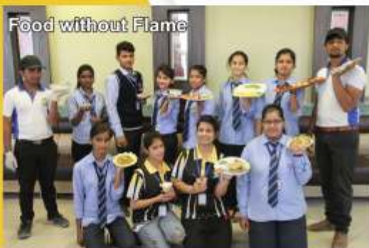
Food without Flame