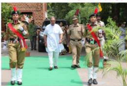
Piloting for HH Gaj Singhji II