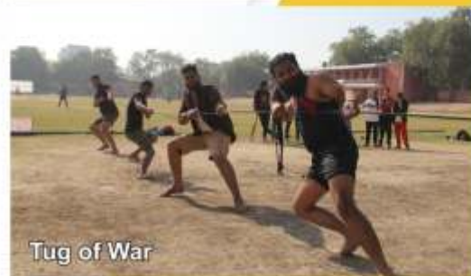
Tug of War