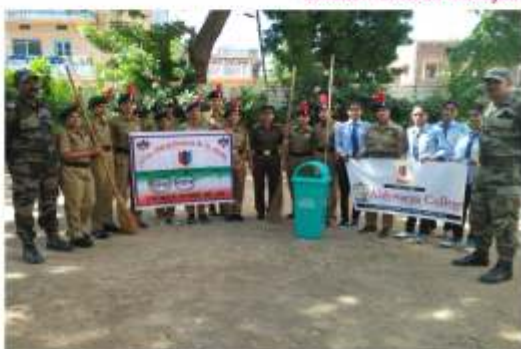
Swatch Bharat Abhiyan