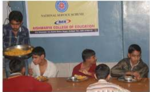
A Day with Blind Students