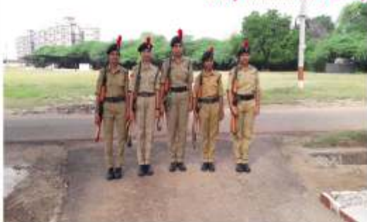
Army Attachment Camp

Aishwarya College is the first Proud co-educational institution in the region to receive 3 Raj Girls Battalion Affiliation for NCC in recent time. The system of NCC in the college has paved way for the female students to develop and educate themselves as per the changing scenario under the guidance of trained NCC personnel and college Associate NCC Officer (ANO). Few achievement of NCC cadet namely Securing 1st position in Firing and Athletics, Selection of Two cadets for prestigious Pre Republic Day Camp (RDC), Selection of cadet for National Integration Camp