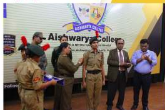
NCC Day Celebration