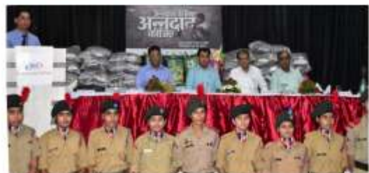
Natural Calamity Donation Camps