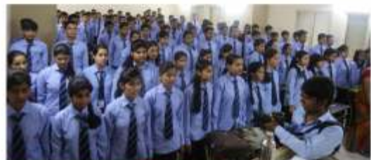
National Anthem Limca Record