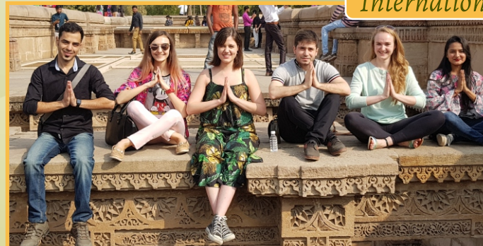
Foreign students at Gujarat Technological University during Winter School Program