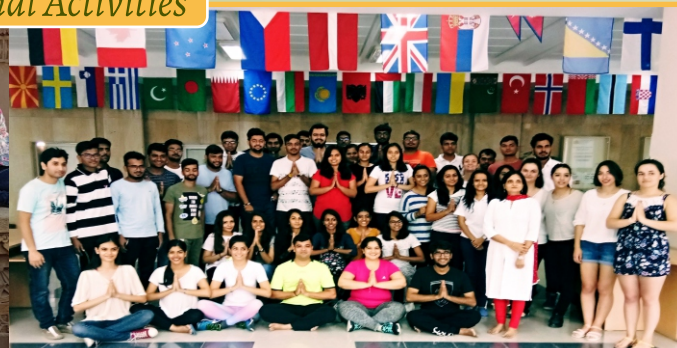
More than 2200 students participated in International Experience Programme (IEP)

1000+ International Students from 66 countries make GTU a truly International University