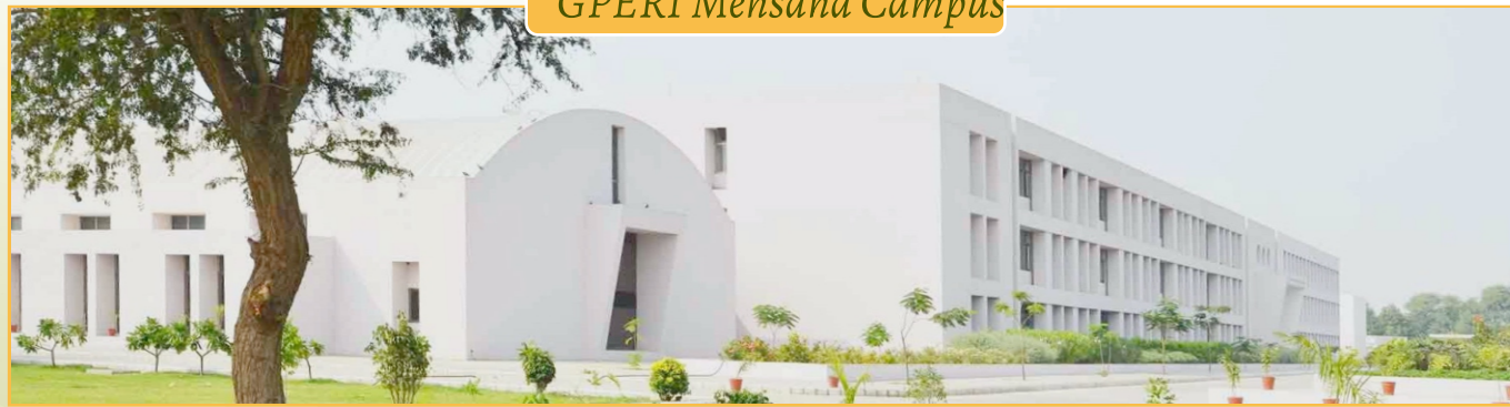
GPERI Mehsana Campus