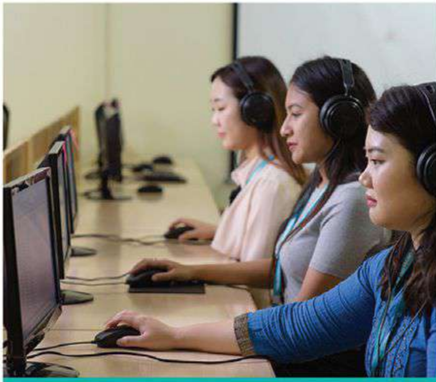
E -GAMING CLUB