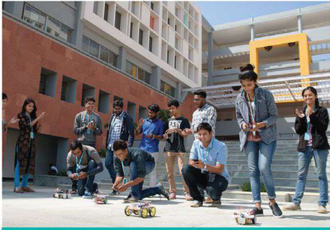
HOUSE OF TALENTS CLUB