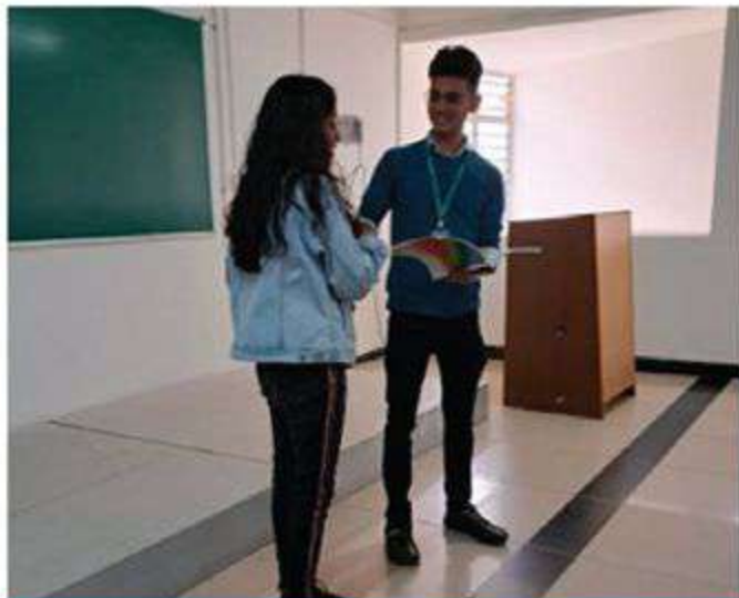
THEATRE CLUB - 2