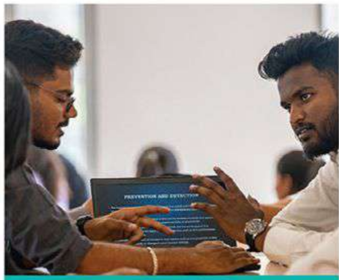
BIZZY HEIGHTS CLUB